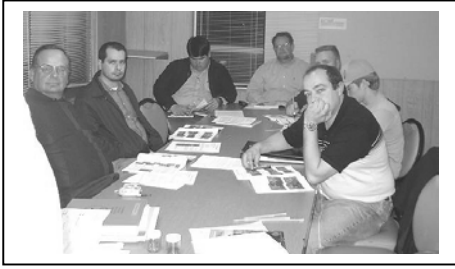
1 st Hunter Safety Class at range

course at SDSSA and they can sign up at the range office.