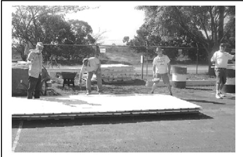
Paint Crew in Action