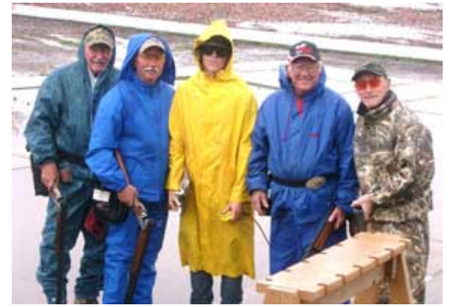
SOME WHO BRAVED THE RAIN.

The UFF-DA OPEN was created 5 years ago to commemorate the Norwegian influence in the area. All of you from the mid-west and other parts of the country that the Norsemen settled know the term and what it means. For the uninformed UFF-DA is a Norwegian expression that used to acknowledge an element of shock/surprise or maybe some exasperation. UFF-DA is a verbal expression to use when you forget your mother-in-laws name in your wedding reception line! There are many other situations and if you put UFF-DA in Google, you will see them.