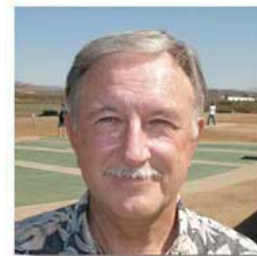
SKEET LEAGUE By Dick Seaver

The above comments are in no way to slight those who were contestants and winners in the PSA Open as there were many others who could share the lime light with my choice of the two pictured.