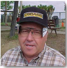
ATA TRAP

The C.G.S.T.A. Southern Zone Shoot was held June 7 th and 8 th at the Club. This is where shooters earn a spot on the Southern Zone team to compete with the Central and Northern Teams at the State Shoot later this month in Kingsburg, CA.