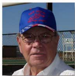
The SDSSA Web Site By Augie Daddi

such that the venture has a margin of profit. This is a way for all shooters to support our youth program and give some of you consistent lunch donors a bit of a break. However, we will be soliciting lunch donors for our Sunday lunch break so be prepared for a contact. A notice will be going out in the near future to all of those who have donated lunches in the past requesting that you volunteer your name to one of the months of 2009. Our 2009 schedule has been sent to CSSA for approval and our 2009 dues have been paid to NSSA. So, we are in a holding pattern until the dates are approved and firm before the letter can go out.